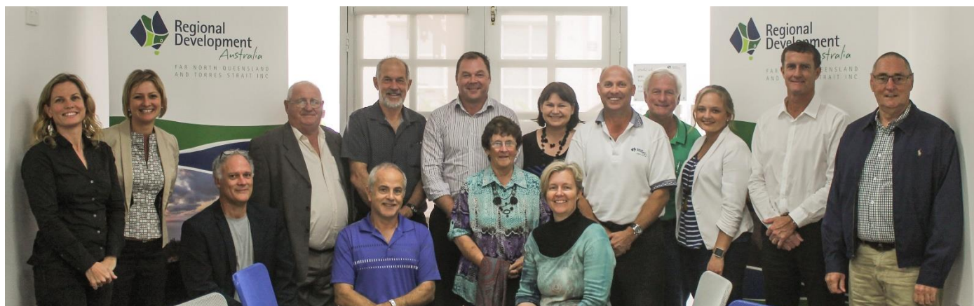
Northern RDA Alliance meeting, Cairns, June 2017

For more information, contact your nearest RDA.